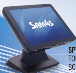
SPT-4801 TOUCH SCREEN