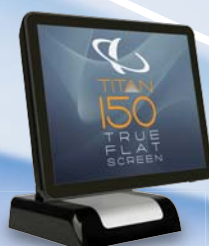
TITAN 150 TOUCH SCREEN