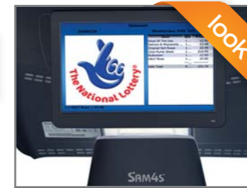
Optional Rear Customer Display.