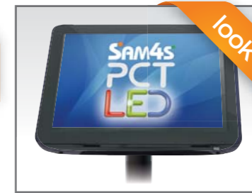
VESA Wall & Pole Mount Option.