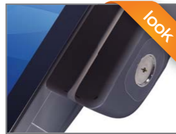
Optional Dallas Key/MSR Sign On.

15" Fanless LED Touch Screen Projective Capacitive Multi-Touch System