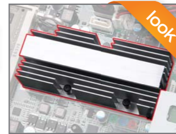
Clean, Quiet Fan Free Design.