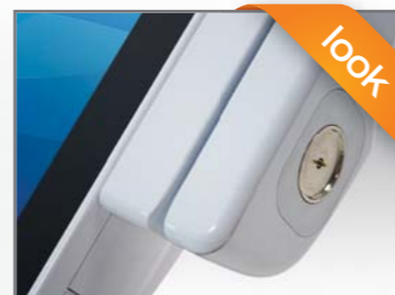
Optional Dallas Key/MSR Sign On.