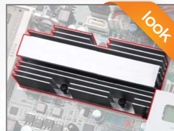
Clean, Quiet Fan Free Design.