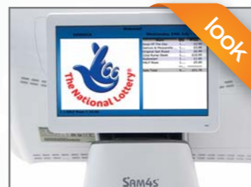
Optional Rear Customer Display.